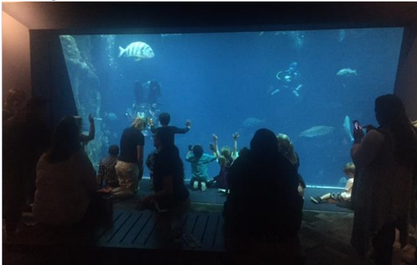
<- Sensory Seas Morning Event for Lowcountry Autism Foundation

Saturday February 25 th we held an early morning opening for children with the Lowcountry Autism Foundation. It was a huge success with high praise and thanks from Education & the event attendees.